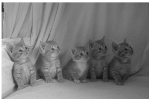
Some of the kittens and puppies that are waiting to find loving new homes...