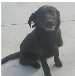
Kelvin Crossbreed 6 mths old

Buster has a very soft quiet nature and loves to be around people. He is very inquisitive and alert