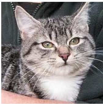
Camilla DSH 3 mths old

Camilla is very inquisitive and full of playful energy. She will happily live with another cat and with her loving nature she will become a great companion