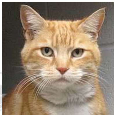
Barry DSH 10 yrs old

Bonnie is a very quiet girl who looks to her brother Stevie for guidance and reassurance. Playing chasey with Stevie is one of her favourite games, as well as chasing ping pong balls. She's a very talkative girl and will regularly call for Stevie if she can't see him ... and there's no mistaking when she's hungry!