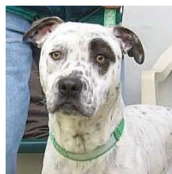
Patch Mastiff X 3 yrs old

Shona is looking for an adult home. She will need a lot of human company during the day and someone who has the time to dedicate to her training