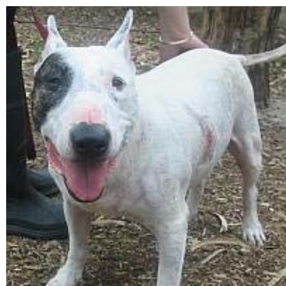
Shiffy Bull Terrier 8 yrs old

All dogs and cats available from Save-A-Dog Scheme are de-sexed, vaccinated, wormed, micro chipped and vet checked.