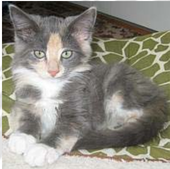
Diorella DMH 3 mths old

Camilla is very inquisitive and full of playful energy. She will happily live with another cat and with her loving nature she will become a great companion