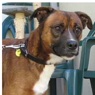
Cougar Crossbreed 4.5 yrs old

Apparently I'm a bit hard to photograph but I'm very handsome and I have the most beautiful nature!