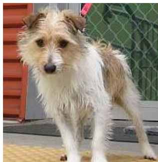
Buster Wire Hair Terrier 2 yrs old

Bobby is a calm and quiet little dog who still has loads of energy and loves his walks.