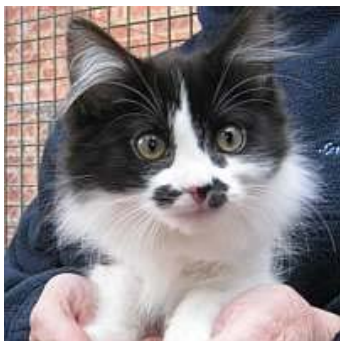
Flora DMH 13 wks old

Diorella is cute as a button and very affectionate. She loves to spend time with you and enjoys settling onto a warm shoulder and purring the time away with you!