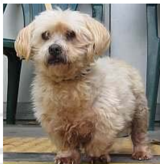
Bobby Maltese X 12 yrs old

Gus is a handsome little dog who never stops wagging his tail. He is full of fun and games and will become a faithful friend