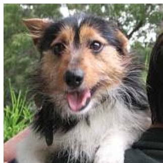
Gus Wire Hair Terrier X 4 yrs old

Seb is a terrific dog. He is full of fun, loves to play with other dogs and has a lovely nature.