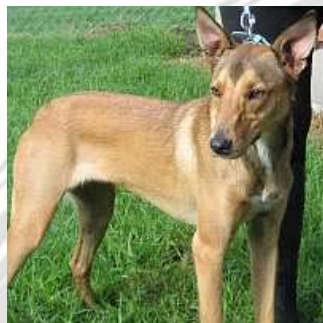
Frankie Crossbreed 12 mths old

Shiffy is delightful around the home, loves a cuddle and a tummy rub, enjoys her walks and especially loves playing ball!