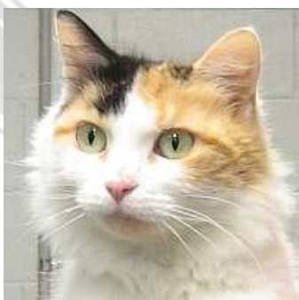
Simone DMH 2yrs old

Flora is a very sweet young kitten and she would dearly love to live with another cat for company as she has lots of youthful energy.