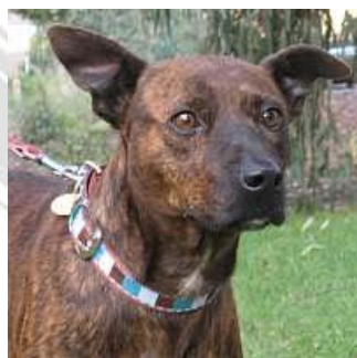
Seb Staffy X 3 yrs old

Cougar is a very sporty dog who loves to run and chase balls. He is very friendly to all and enjoys the company of other dogs