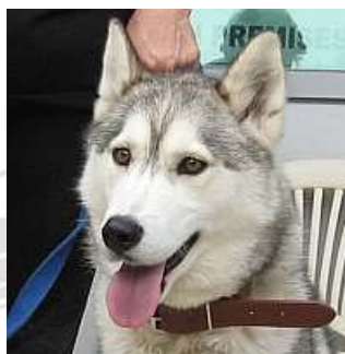
Shona Husky 2 yrs old

Kelvin is a very happy lively pup. He is full of fun and has a very good nature.