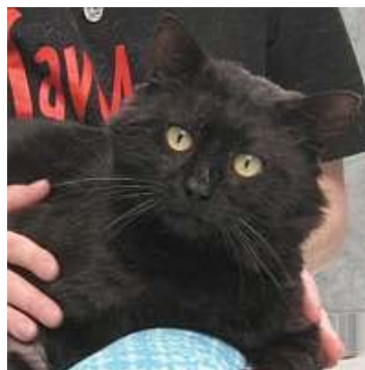
Midnight DSH 6 yrs old

Barry is 10 years young and like the ginger spice, he will warm your heart and soul. Once he has moved in you will wonder how you ever managed without him.