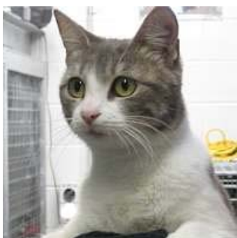
Nina DSH 2yrs old

Simone is confident, sassy, and full of love. She is very chatty with humans and other cats and life will be loads more fun once she has moved in to your home